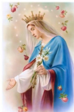
"She is more Mother than Queen." --Saint Therese of Lisieux, Doctor of the Church

This institution is an equal opportunity provider.